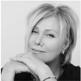
Founder Deborra-lee Furness